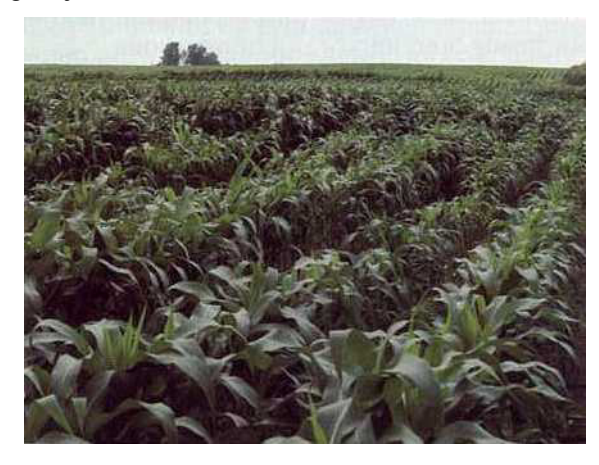
Uneven early growth can be caused by a variety of environ-mental stresses. Genetically purple corn and green corn are equally susceptible to stresses that cause uneven development. In this case, uneven growth resulted from ammonia misapplication that allowed seedlings to closely contact ammonia.

Literally, each seedling has a unique environment for growth and, as a result, some unevenness in plant development will occur. Growers should only be concerned when uneven growth is abnormally great. Perhaps a management strategy is needed to minimize some of the stresses to which the seedlings are being subjected.