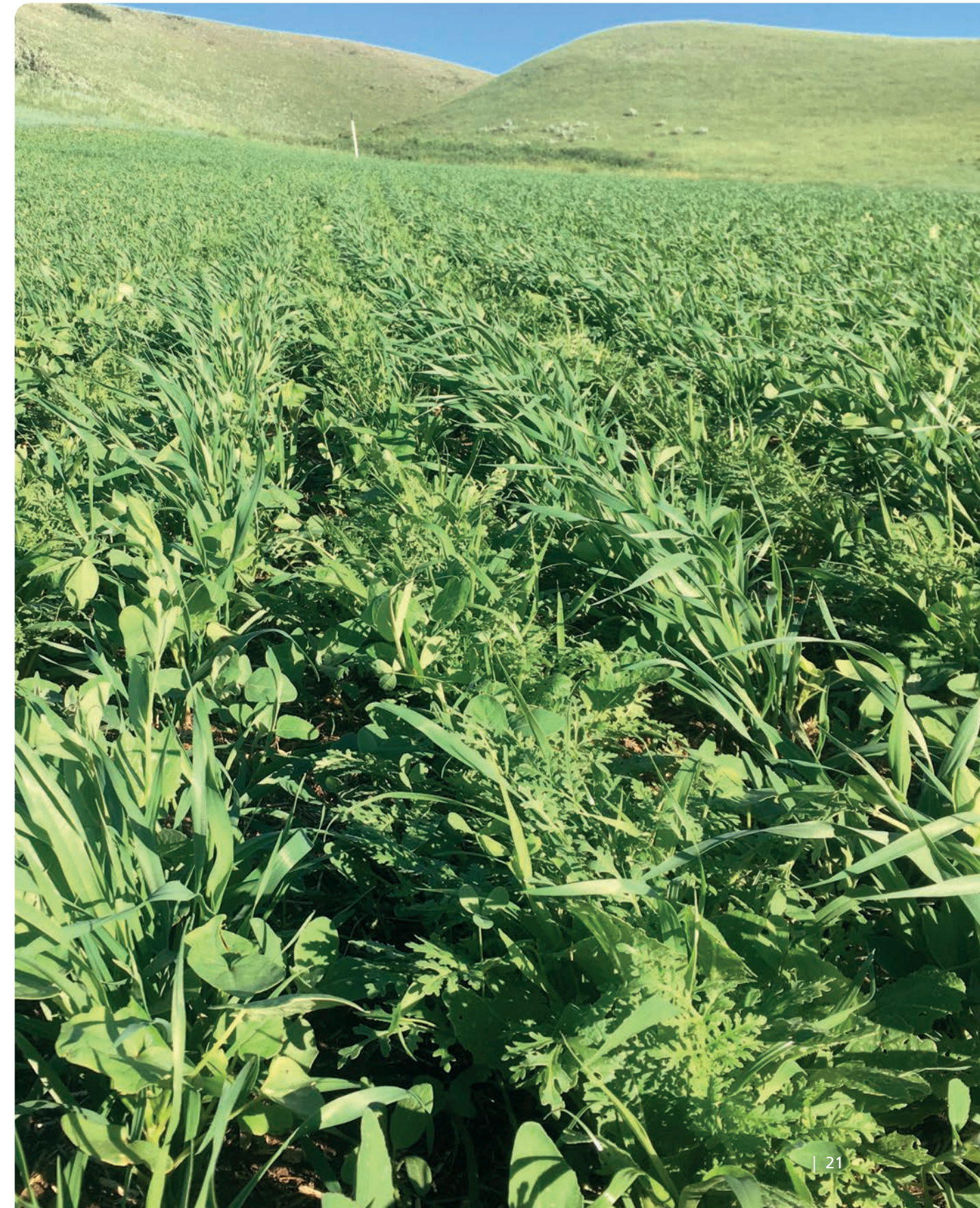
Cereal intercrop with cover crops

Drill is a 30' John Deere 1990 CCS on 7 1/2" spacing with an APV PS800 pneumatic seeder intercepting into the JD primary hoses. The PS800 allows for precision metering of seeds from 200 down to 1/2 lb per acre. Also easily configures to Intracropping- cereals on 15" spacing through JD tank, covercrop seed through APV sown between cereal on 15" spacing at shallower depth. Eco Valley Equipment is an authorized dealer for APV specialized equipment, and manufactures kits to integrate the APV pneumatic seeders onto JD box and air drills.