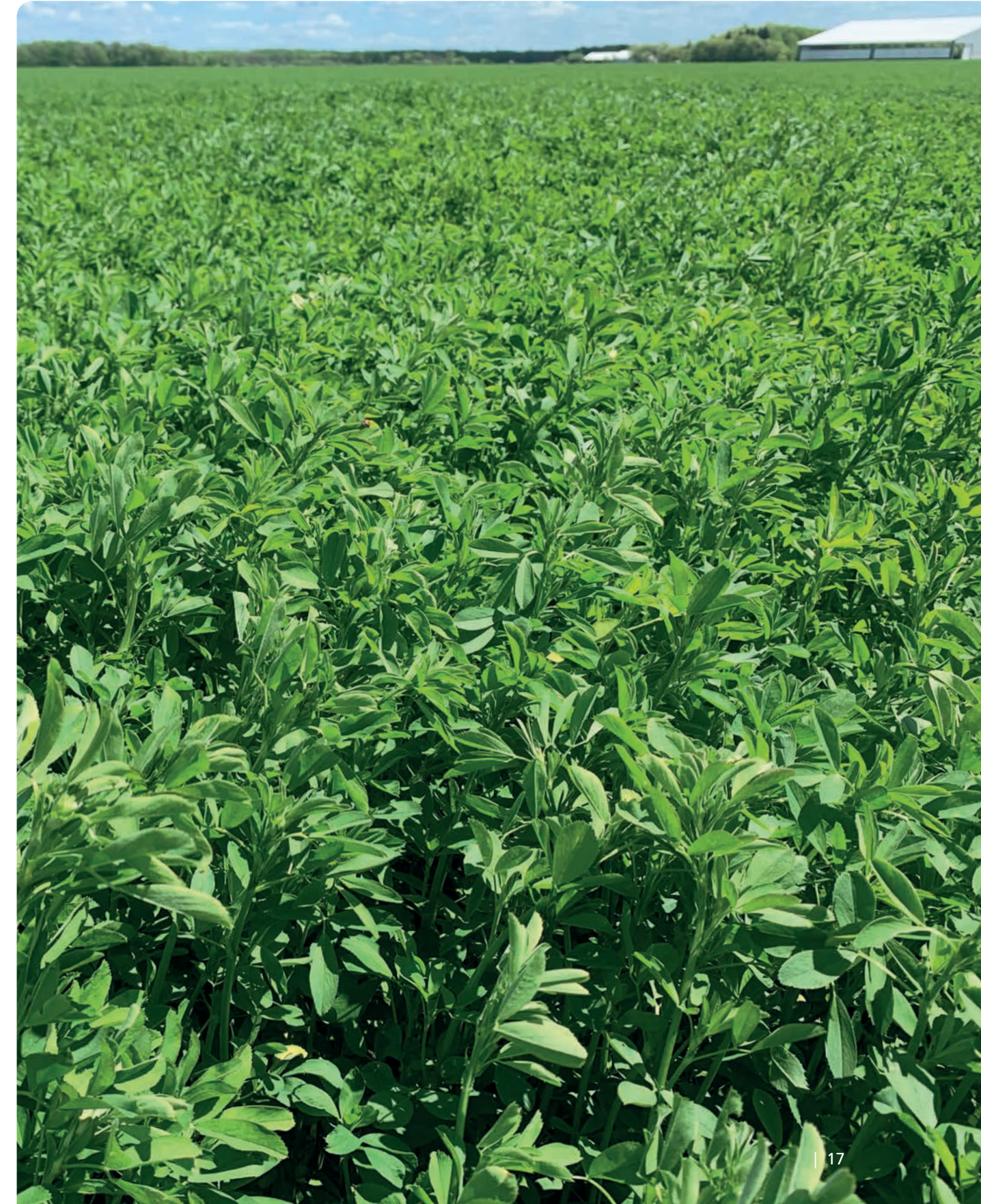
REVOLUTION MD field near Ste Anne MB

Contact your DSV Northstar dealer or sales agronomist for more information on growing low lignin alfalfa as a feed source or as an income driver on your operation.