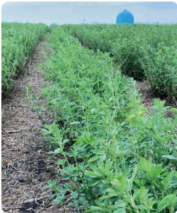
Alfalfa production field

Our production advisors are highly knowledgeable and will be able to assist you every step of the way. Your success is our success. If you are interested in finding out about grower opportunities please contact our office to be put in touch with your area's production advisor for more information.