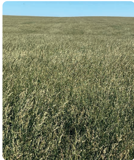
Tall Fescue production field