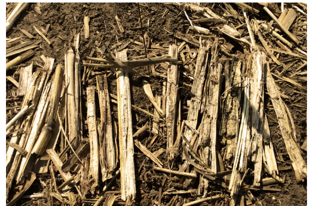
⊕ Residue from conventional rolls on the left compared to residue from 360 CHAINROLL on the right.