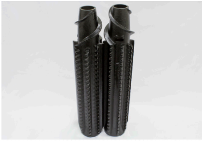
⊕ Unique "mixed flute" design allows consistent performance in tough conditions.